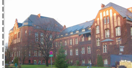
„Alte Nervenklinik“ Charité, Berlin

Brandenburg Gate and Potsdamer Platz at night, Berlin